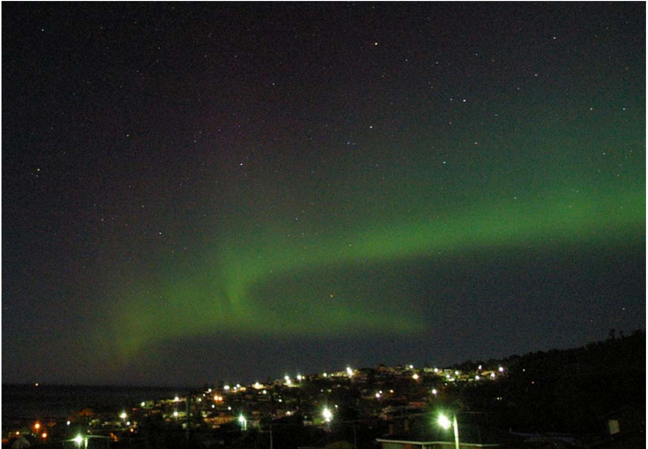
Figure Two: Aurora observed 25 August, 2005 in Southern Tasmania, Australia.

Major geomagnetic and ionospheric storms can last for several days, causing severe disruption to HF communications. Associated with such storm periods is also the Aurora, one of the better known ionospheric phenomena.